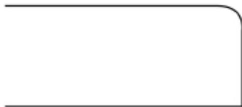
Eased (Pencil Over)